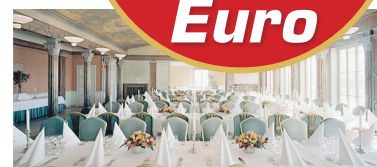
The playing venue